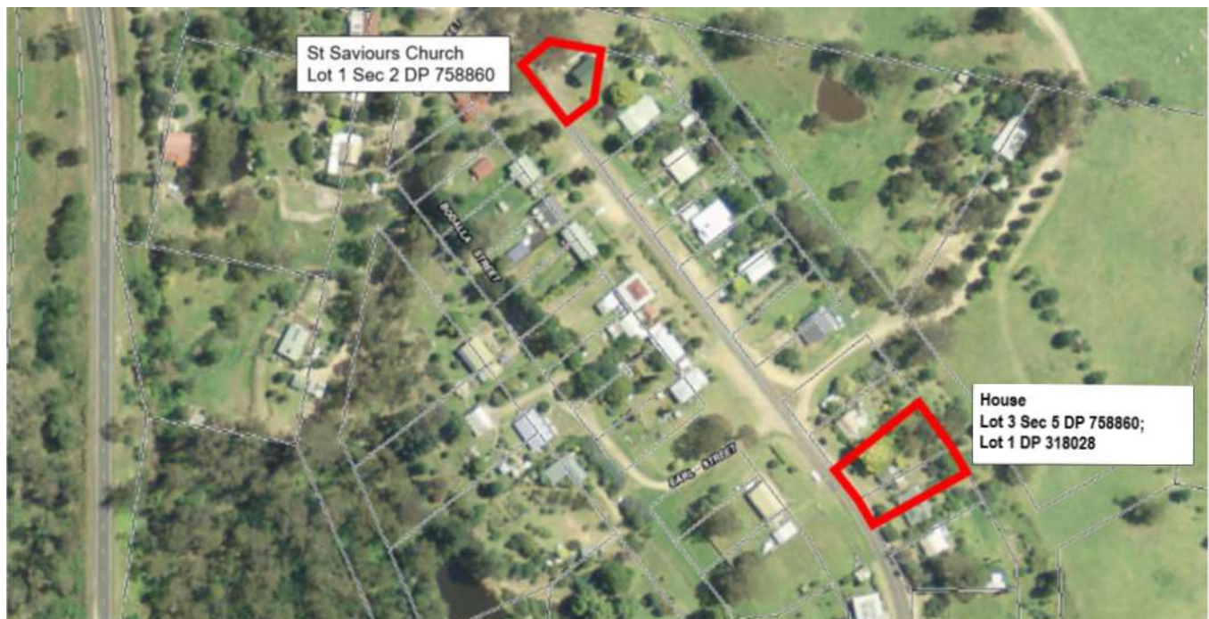
Image 1 Sites in Quaama Village to be removed

The images below have been taken from the planning proposal showing the location of the 8 sites.